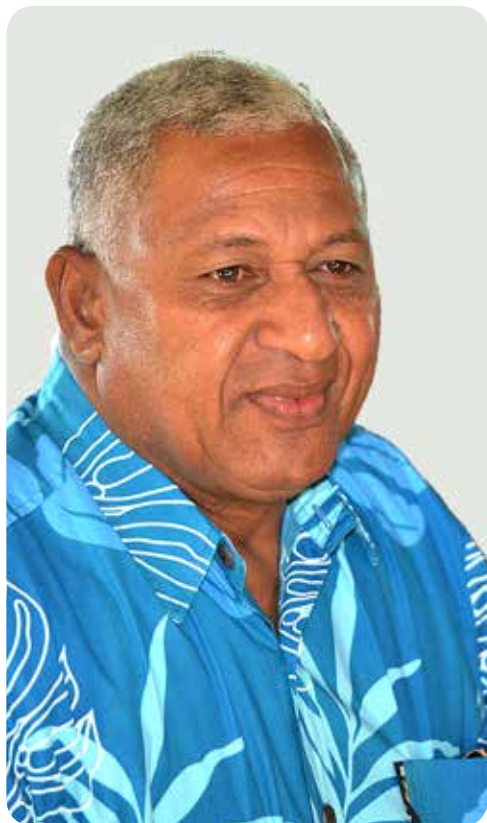
RATU VOREQE BAINIMARAMA

I wish to congratulate the Rugby Family in Fiji in formulating the FRU Strategic Plan 2017 – 2021.